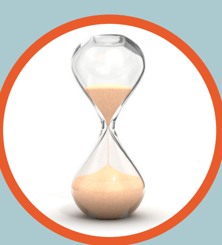
If you observe any of these signs (independently or together), call 911 immediately.