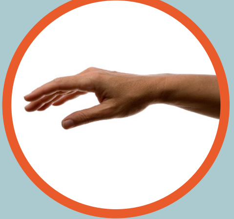
Ask the person to raise both arms. Does one arm drift downward?